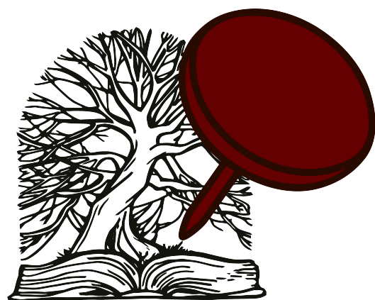
Tremont Library Programming